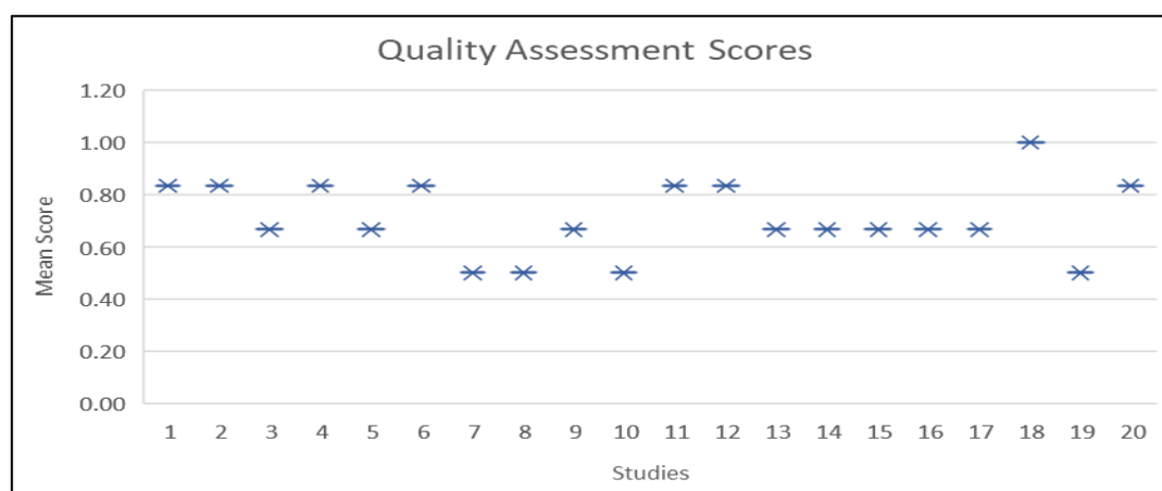
Fig. 2. Quality assessment scores for each study selected in this review

Later, the mean score was calculated to ensure each paper achieves 50 percent eligibility to be included in the review. Fig 2 shows the chart of quality assessment scores derived for each paper, which explains that all selected papers have achieved 50 percent eligibility. Therefore, the studies selected for this review are all considered relevant.