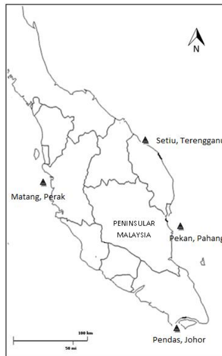
FIGURE 1. Map of Peninsular Malaysia showing mangrove area where larval fish were collected.

Identification of individual larval fish to the family level and if possible, to genus level was carried out based on appropriate literature (Russell, 1976; Okiyama, 1988; Jayaseelan, 1998; Leis and Carson-Ewat, 2000; Ghaffar et al. , 2010). Morphological identifications were usually successful up to the family level and, for some individuals, up to the genus and species level. All individuals were measured to the nearest 0.1 mm total length, except for certain individuals lacking tailfins and tightly coiled or folded body shape. Voucher specimens were kept in the Aquatic Laboratory, Aquaculture Department, Faculty of Agriculture, Universiti Putra Malaysia, Serdang.