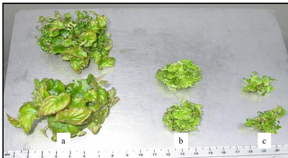
Figure 2. (a-c) Shoot clumps derived from different culture conditions after 4 weeks in cultures. All cultures were cultivated in MS supplemented with 0.1 mg/L BAP (a) Shoot culture in TIM. Each clumps sized around 8- 10 cm (b) Shoot culture in LM. Each clumps sized around 3-4 cm (c) Shoot culture in SM. Each clumps sized around 2-3 cm

Culture observation was made every day until the 4th weeks in culture. The results clearly indicated a significant increase in propagation rate in TIM as compared to LM and SM (Figure 2). The number of plantlets obtained in TIM was nearly doubled to LM and least plantlets were obtained in SM. This result indicates that liquid culture systems especially TIM improved the efficiency of in vitro propagation of B. pavonine as compared to LM and SM. In addition, no malformation of plantlets was obtained in TIM. Further development of the plantlets in TIM was also fast and without growth arrest, thus the use of TIM is recommended for this species. It is also noted that B. pavonina grew healthily with more stable morphological characteristics in TIM. No hyperhydric shoots was observed in the culture (Figure 1c).