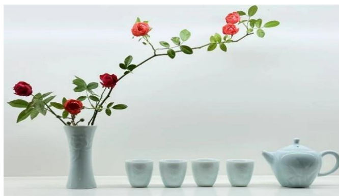
Figure 1. Creative products of functional ceramics

Ceramic cultural and creative products, as a type of arts and crafts product, are ceramic art products that combine practical and aesthetic principles. In the Jingdezhen Ceramic Creative Market, the creative products of college students are mainly divided into two categories, namely "functional ceramic creative products" (Figure 1) and "decorative ceramic creative products" (Figure 2). Usable ceramic creative products are ceramic products aimed at "artistic creation of daily necessities". They mainly embody the beauty of creative handcrafting and are characterized by irregular geometric shapes. In terms of molding technology, they are mostly shaped in the form of blank drawing, clay bar construction, mold pressing, and other forms. Such as tea sets, incense sets, food plates, etc. Decorative ceramic creative products are often expressed in the form of "art life oriented". Usually used as an ornament in daily life, this type of ceramic creative product emphasizes the ornamental, original, and conceptual aspects of ceramic art in terms of artistic expression characteristics. In ceramic decoration, the main techniques are blue and white, underglaze multicolored, high-temperature colored glaze, pink, and new colors. Mainly through personalized expression language, reflecting strong ideological emotions and unique aesthetic sentiment.