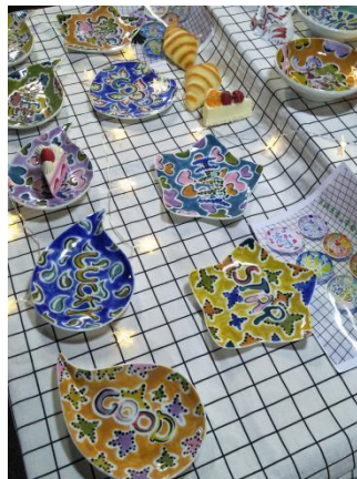
Figure 4. Creative porcelain plate